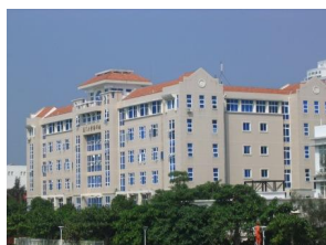
Zeng Cheng Kui Building

Please, let us know your arrival and departure day and time so that we can confirm the hotel rooms. Please send the information to the GEOTRACES IPO ( ipo@geotraces.org ) no later than 15 July 2011.